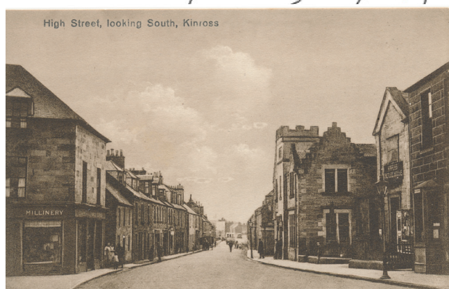
A postcard c.1930 from the collection of David Millar, showing Kinross Picture House and the building now housing Unorthodox Roasters.