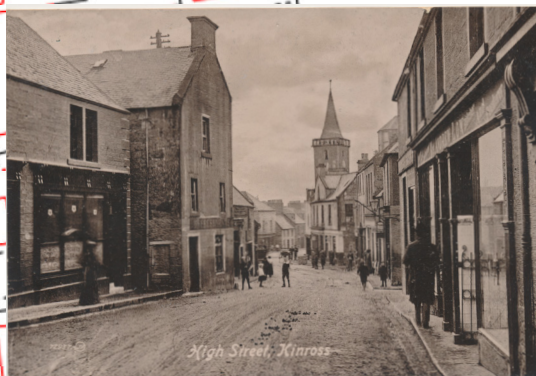
A postcard post-dated 1914 from the collection of David Millar, showing Kinross High Street looking South to the clock tower.